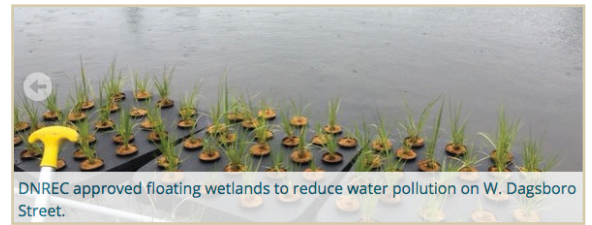
DNREC approved floating wetlands to reduce water pollution on W. Dagsboro Street.

It is important that the dead tree(s) be cut to ground level, but stump may remain. After the tree is removed it is important the wood be