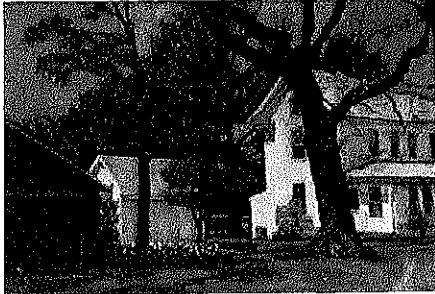
Evans-West House Painting by Laura Hickman

The new Coastal Towns Museum in the Evans-West House, a 1901 Gothic Revival House at 40 West Avenue, will show life in eastern Sussex County from 1688-2000.