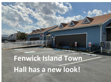
Fenwick Island Town Hall has a new look!

House Registry forms are available on our website or by contacting Town Hall at (302) 539-3011.